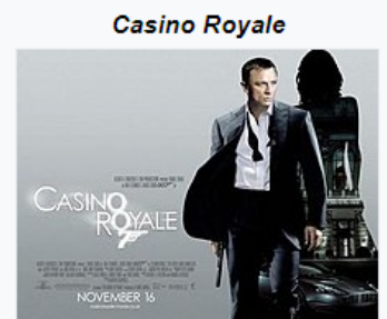
UK theatrical release poster

To recoup his clients' money, Le Chiffre organizes a Texas hold 'em tournament at the Casino Royale in Montenegro. MI6 enters Bond — the agency's best poker player — in the tournament, believing a defeat will force Le Chiffre to seek asylum with the British government in exchange for information on his clients. Bond is paired with Vesper Lynd, a British Treasury agent overseeing the $10 million buy-in. They meet their contact, René Mathis, in Montenegro. Obanno, furious that his money is missing, threatens Le Chiffre but allows him to continue playing to win back the money. Obanno and his bodyguard attack Bond, who kills them both. Bond loses his $10 million stake after Le Chiffre is tipped off about his own tell, and Vesper refuses to authorize an additional $5 million for Bond to continue. However, fellow player Felix Leiter, a CIA agent, stakes Bond to the money in exchange for letting his agency take Le Chiffre into custody. Le Chiffre's lover, Valenka, poisons Bond's martini, but Vesper rescues him. Bond returns to the game and wins the tournament. Le Chiffre kidnaps Vesper to trap Bond and takes them to an abandoned ship. He tortures Bond to reveal the password to the bank account holding the winnings, but Bond resists. Mr. White bursts in and kills Le Chiffre but inexplicably spares Bond and Vesper.